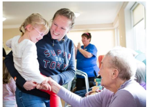
Intergenerational interaction in East Dunbartonshire

A small grant from the East Dunbartonshire Community Fund allowed LMNS to present four performances in care homes and nurseries in the area designed to involve both nursery children and care home residents in an intergenerational setting. These were received very well by both parties, and we shall apply to the fund again to run similar performances in 2018/19.