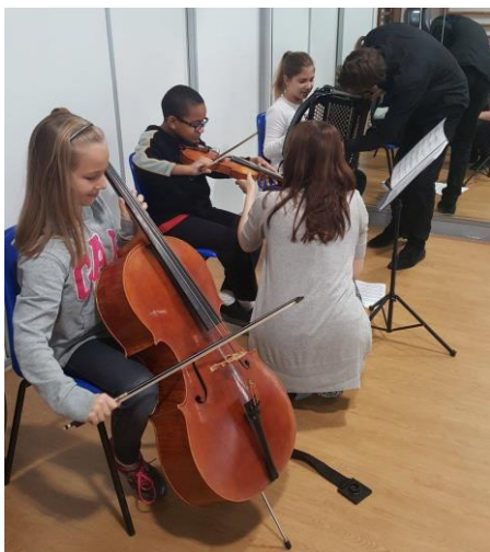
French youngsters trying out instruments at a Live Music Now Scotland collaborative concert in Paris with the Scottish Government.

Live Music Now Scotland continued to lead on the international development of the scheme on behalf of LMN throughout the UK. International performances included six events for refugees in Munich, led by Scottish traditional trio Kilda, in collaboration with LMN Munich. The project led to a dissemination session at the Saltire Society for LMN musicians and other interested parties, and a further talk given for the u3A in Edinburgh.