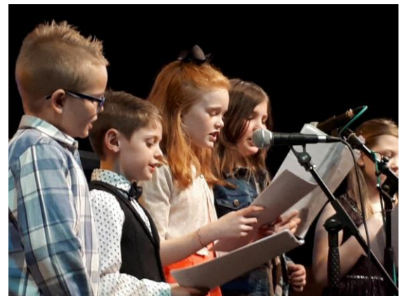
Young people in Rothesay at the culmination of 'Belt it Oot Bute!'

Belt it Oot Bute! was completed in the early part of 2017/18. This was a song-writing project with school pupils in Rothesay, working in collaboration with Achievement Bute, an organisation which provides support to island children, especially those with additional needs and their families. Four traditional musicians led weekly workshop sessions working with primary and secondary pupils, helping them to write their own songs. The results were performed live by the group at Rothesay Joint Campus. In addition to that, a summer programme of workshops led by Aonach Mòr and Akrowa UK took place, resulting in a public performance for the local community.