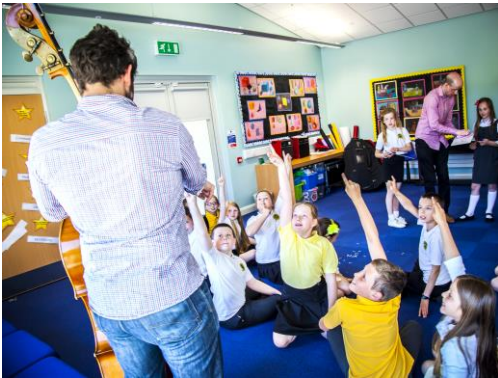
Stringsound delivering a Pitch, Pulse and Magic session

LMNS worked in partnership with five local authorities to deliver projects as part of their Youth Music Initiative grants. In Dumfries and Galloway, 91 performances and one CPD session, linked to the Pitch, Pulse and Magic programme, were presented by three classical duos.