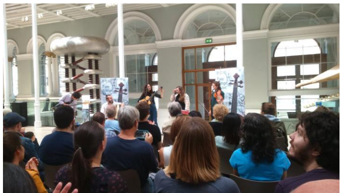
Tir Eolas performing at the National Museum of Scotland at the Edinburgh Festival Fringe

Live Music Now Scotland continued to give invaluable public performing opportunities to musicians who are part of the scheme, often supporting partner organisations, such as the National Galleries of Scotland and National Museums Scotland, with their education and outreach programmes. Festivals also provided public platforms which raise awareness of the organisation, including Music at Paxton, Cumnock Tryst, Young at Heart, St Magnus International Festival, Edinburgh Festival Fringe, East Neuk Festival, Aberdeen International Youth Festival, Merchant City Festival, Loch Shiel Festival and Luminare, Scotland’s Creative Ageing Festival. The Usher Hall in Edinburgh presented the seventh season of Emerging Artists concerts, giving seven ensembles a public platform in one of the world’s finest concert venues.